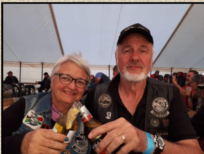
2019 Gemsbok Rally - Upington, Northern Cape

On the 14 November 2017 was the beginning of a new chapter in our lives.