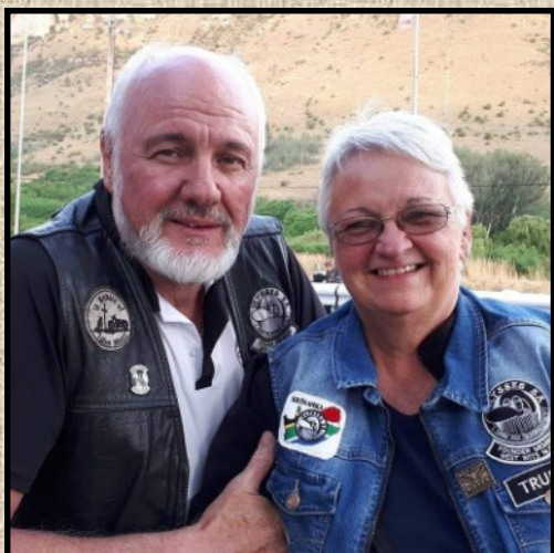
2018 Ulysses Bi-Annual Meeting - Clarens, Free State